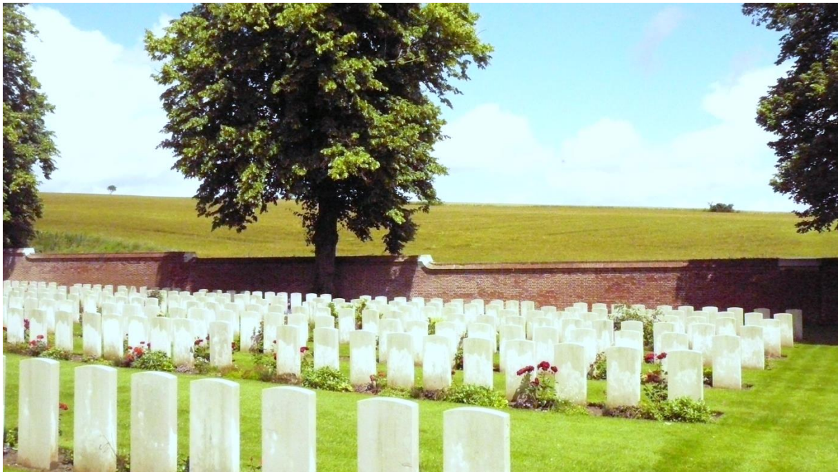
The German front line of 3 September 1916 was along the ridge shown in this photograph, viewed from Ancre British Cemetery, Hamel. 3

The scene of Hoad's death was typical of the war: a major attack against almost impossible odds, with the second and third waves facing an impassable barrage of shells. The battle was immediately above the northern bank of the river Ancre and its marshes, and a little north-east of the village of Hamel. Hoad's battalion was part of the 116th Division, which made initial gains but was pressed back. It must have been in the withdrawal that he died. 2